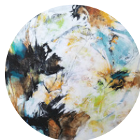
April 2018 Abstraction