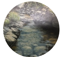
January 2018 Members Exhibition