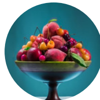
November 2017 Photography