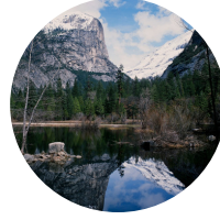
July 2018 The Great American West