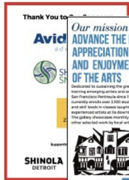
Thank You to Sponsors