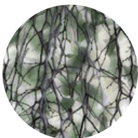
Feb & March 2018 Works on Paper