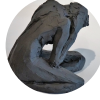
August 2018 The Human Form