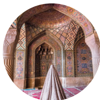
May & June 2018 Photography and the Creative Eye