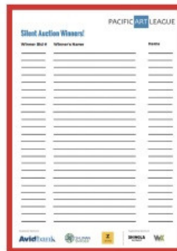
Silent Auction Winners