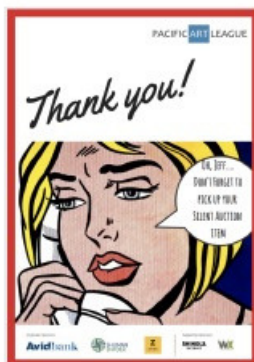
Silent Auction Pick Up Reminder