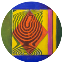
August 2017 Science, Technology & the Future of Art