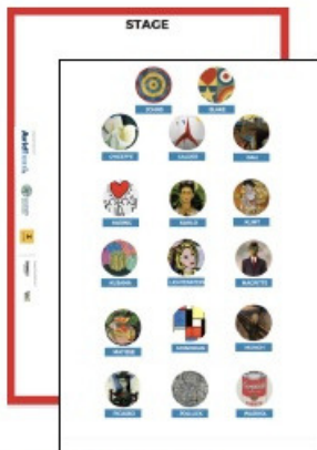
Table Seating Chart