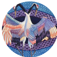
September 2017 96th Anniversary Exhibition