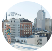
October 2017 Landscape, Seascape & Cityscape