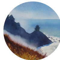
December 2017 Holiday Art Market