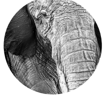
Sept & October 2018 Africa the Struggle of Beauty